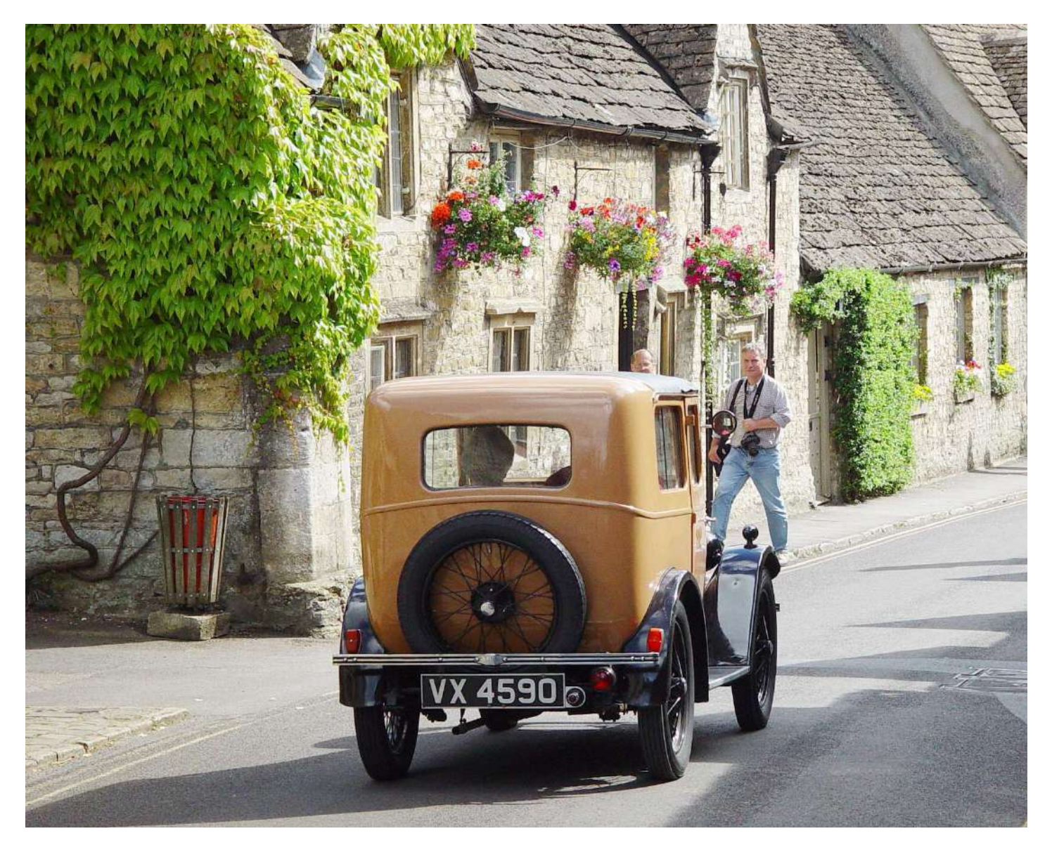
Pre-War Wiltshire Friday 23<sup>rd</sup> to Sunday 25<sup>th</sup> May 2026

Our first ever spring rally weekend! Two days of touring and rallying in the spectacular countryside just north of Bath where we last rallied in 2002! The weekend will be based at the ancient and welcoming White Hart at Ford and will include a fascinating visit to the Badminton Estate. More details to follow, but for now, make a note of the date.