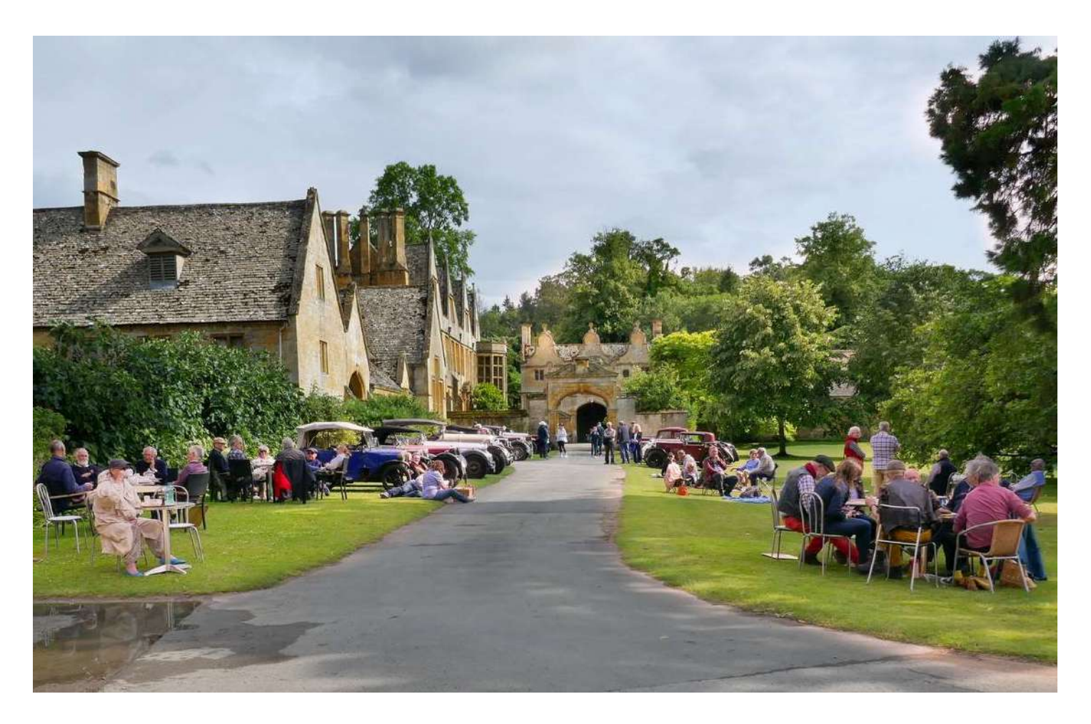
Pre-War Cotswolds Friday 5<sup>th</sup> to Sunday 7<sup>th</sup> September

Entries are now open for our brand new autumn amble in the glorious Cotswolds. As you know, the Vintage Minor Register is 25 years old this year, having been founded in 2000. In 2003, we held our first rally weekend in the Cotswolds and then followed fourteen more fantastic Cotswolds rally weekends between 2003 and 2023. So what better way to celebrate our first 25 years than to hold a rally around the glorious Cotswolds, visiting the very best haunts, hostelries (and breweries!) that we have enjoyed over so many years, including cream teas at Stanway House where we have enjoyed so many wonderful afternoons.