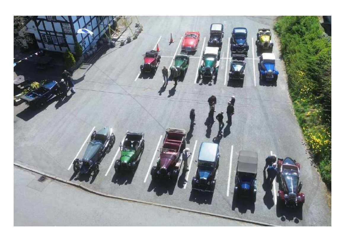
Autumn Pub Meet – The Old Bull, Inkberrow Sunday 19th October

All welcome at our traditional autumn Oktoberfest gathering at what has become the Register's very own pub! Breakfast at Ye Olde Hobnails, Little Washbourne, from where we will wend our way to lunch at The Old Bull. Join us for breakfast or simply come along to the Old Bull at lunchtime.