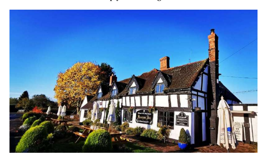
Monthly Lunchtime Pub Meets The Fountain, Oldwood, near Tenbury Wells Every third Sunday lunchtime

All welcome at our traditional autumn Oktoberfest gathering at what has become the Register's very own pub! Breakfast at Ye Olde Hobnails, Little Washbourne, from where we will wend our way to lunch at The Old Bull. Join us for breakfast or simply come along to the Old Bull at lunchtime.