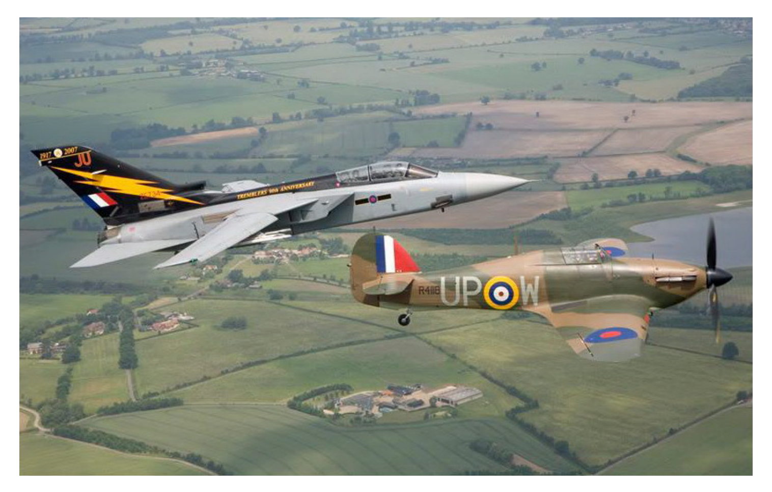
1940 Hawker Hurricane Mk. 1 R4118 UP-W with a close escort from a different era, a 111 Squadron Tornado F3 from RAF Leuchars. Both now retired.